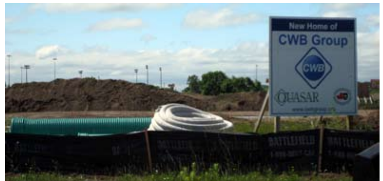
Site of the future CWB Group building at 8260 Parkhill Drive.

The function of the Bureau is to provide certification services in accordance with established standards or other documents. The Bureau has over 100 full and part-time