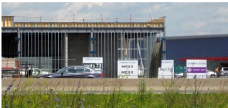
Milton Crossroads commercial building (Phase II)

The second phase of First Gulf Corporation's Milton Crossroads will provide 105,400 new square feet of commercial space adjacent to the current Canadian Tire, south of Steeles Avenue near James Snow Parkway off Highway 401. Confirmed tenants include Indigo, Mexx, Smart Set, Roots, Mr. Big & Tall, Mucho Burrito, Extreme Pita, and an optical store. The Phase II is expected to open by Fall 2009. The first phase of Milton Crossroads opened in 2004.