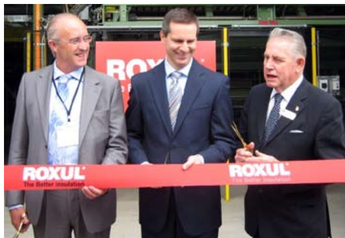
Rockwool International CEO Eelco van Heel, Ontario Premier Dalton McGuinty, and Milton Mayor Gord Krantz prepare for the ribbon cutting ceremony to mark the official opening of the Roxul plant expansion.

The $150 million expansion is expected to create 100 new jobs at Roxul and will contribute over $2.5 million annually to the local economy. With the expansion, the total size of the Roxul facility is 700,000 square feet and production capacity of its wool insulation will triple, while managing emissions.