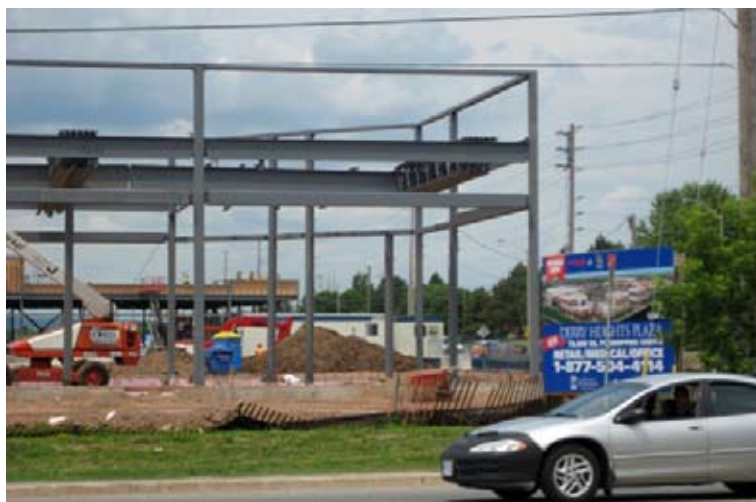
Derry Heights Plaza (Derry Road & Bronte Street)

The other major development is the Derry Heights Plaza being built by First Capital at the corner of Derry Road and Bronte Street. It will be a 71,000 square foot plaza that to date includes a Shoppers Drug Mart, Royal Bank of Canada and Canadian Imperial Bank of Commerce.